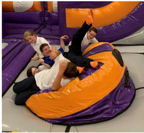
Year 8 students having fun at Gravity