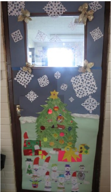
3 rd place – Year 9