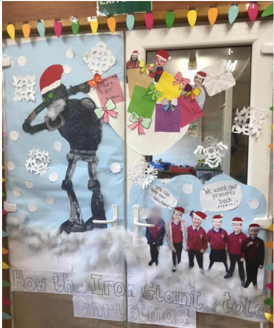
1 st place – Lower juniors for the best dressed door