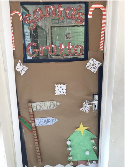
2 nd place – Year 10A