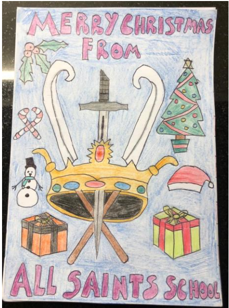
1 st place - Rose for the Christmas card and meme competitions