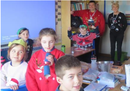
Year 6 party