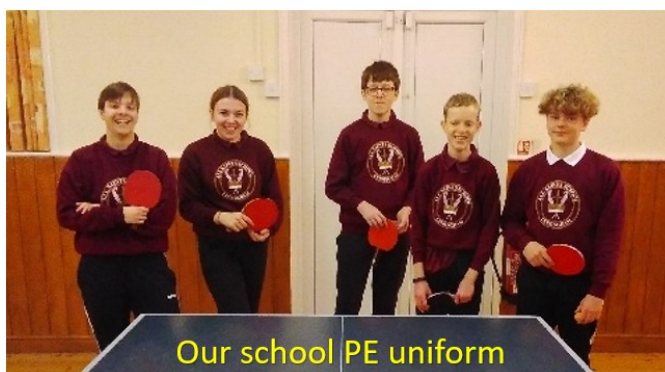
Our school PE uniform