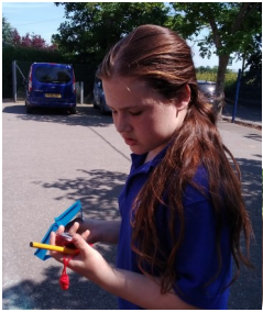
Year 6 learned about paper airplanes, measuring the distance and time it takes them to land.