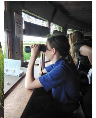
The juniors had a fantastic morning at...