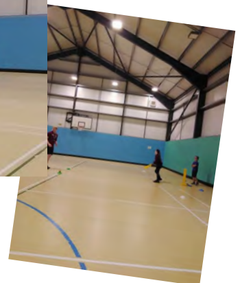
the indoor cricket and athletics festival at Broadland Sports Centre.